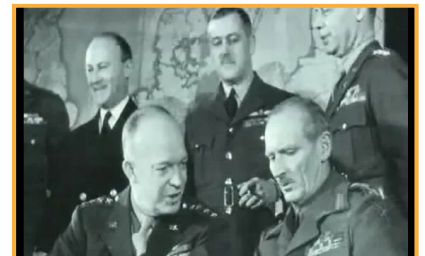
Captain James Stagg (front right) in discussion with General Dwight Eisenhower (front left)

Eisenhower had wanted a yes just as much as everyone else, if not more. But he also trusted that Stagg knew what he was doing. So Eisenhower listened. He postponed the invasion. On 5 June, the storm hit exactly as Stagg had predicted, with violent winds and churning seas. Had the invasion been launched that day, it would almost certainly have ended in disaster. Instead, on 6 June 1944, in a brief window of calmer weather that Stagg had also forecast, the invasion went ahead. The operation - known as D-Day - was a success, and it